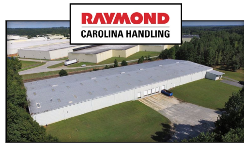
60,650 SF Industrial Property Landlord Representation and Leasing 196 Michelin Court, Piedmont, SC