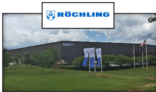
150,000 SF Industrial Property Tenant Representation and Leasing 201 Commerce Court, Duncan, SC