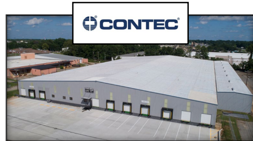
115,000 SF Industrial Property Landlord Representation 250 Broadcast Drive, Spartanburg, SC