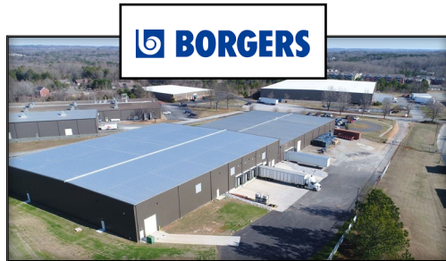
70,000 SF Industrial Property Development and Leasing 225 Commerce Court, Duncan, SC